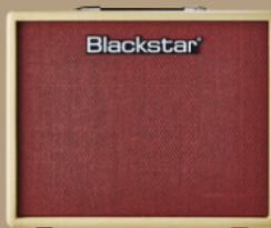
BLACKSTAR DEBUT 50R 1X12 COMBO £209

WHAT IS IT? Dual-channel lightweight combo with 50 watts of Class D power (switchable down to five), stereo headphones/line out, series effects loop and two colour schemes